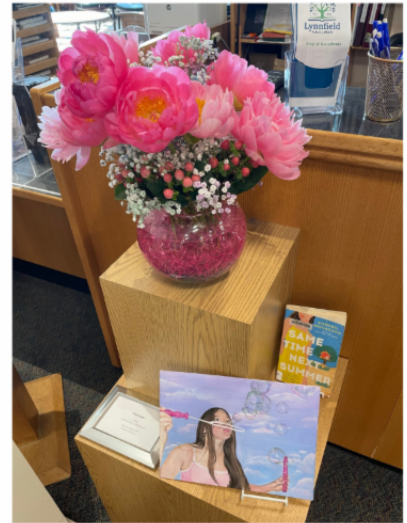
Photos from last month's Art in Bloom at the Lynnfield Public Library. Thanks to all who participated and visited the show!