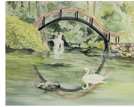
“Under The Bridge”