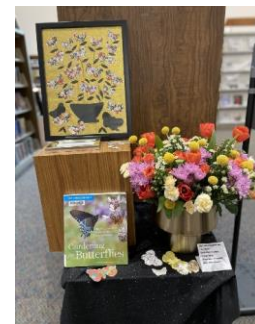
"A Bouquet of Butterflies"

Artist: Pauline Finberg Medium: Mixed/Collage Inspiration: