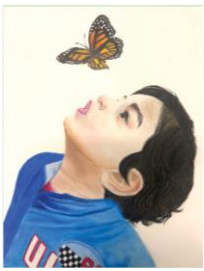
“My brother with a butterfly”