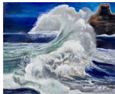
Wave – Watercolor Britt Inger-Daw