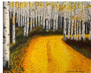
Birch Splendor - Acrylic Cynthia Ruocco