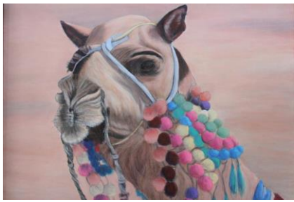
Decked Out – Acrylic Shaila Desai