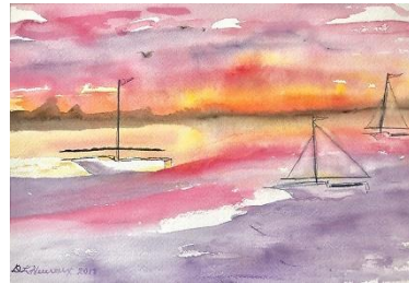
Morning Sunrise – Watercolor Darlene L'Heureux