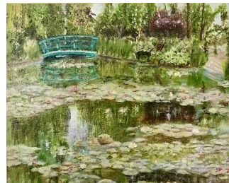
Monet's Garden Giverny France – Oil Sanjay Aurora