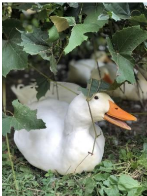
Sitting Duck