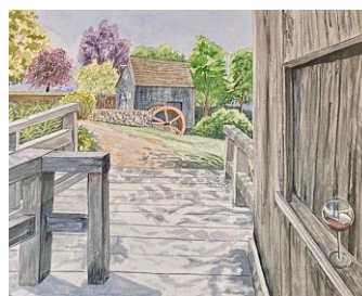
Wine With A View – Watercolor Patricia O'Connor