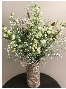
Floral Arrangement by Inta Brazelis-Simeone