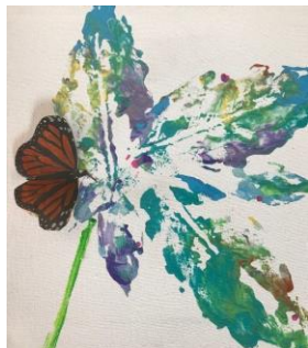
Monarch In The Garden Acrylic & Watercolor Kendall Ingles