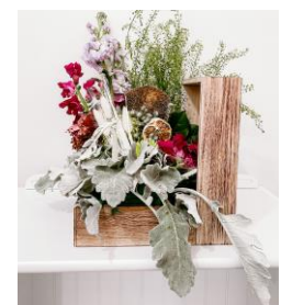
Floral Arrangement by Colleen Dunleavy & Crystal Mills