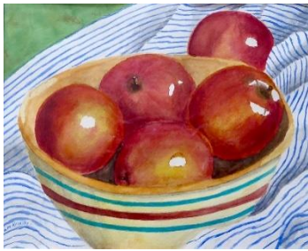
Picnic With Apples – Watercolor Pam Krinsky