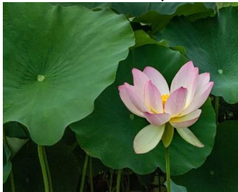
Lotus Blossom