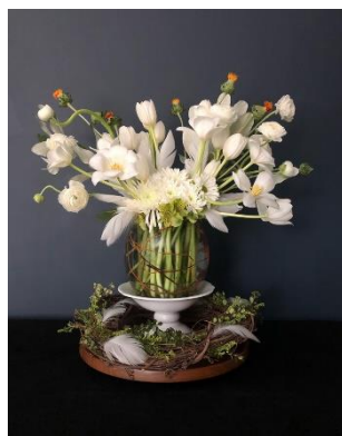
Floral Arrangement by Yvonne Blacker