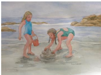
Beach Girls – Watercolor Louise Anderson