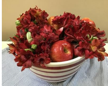
Floral Arrangement by Ellen Crawford